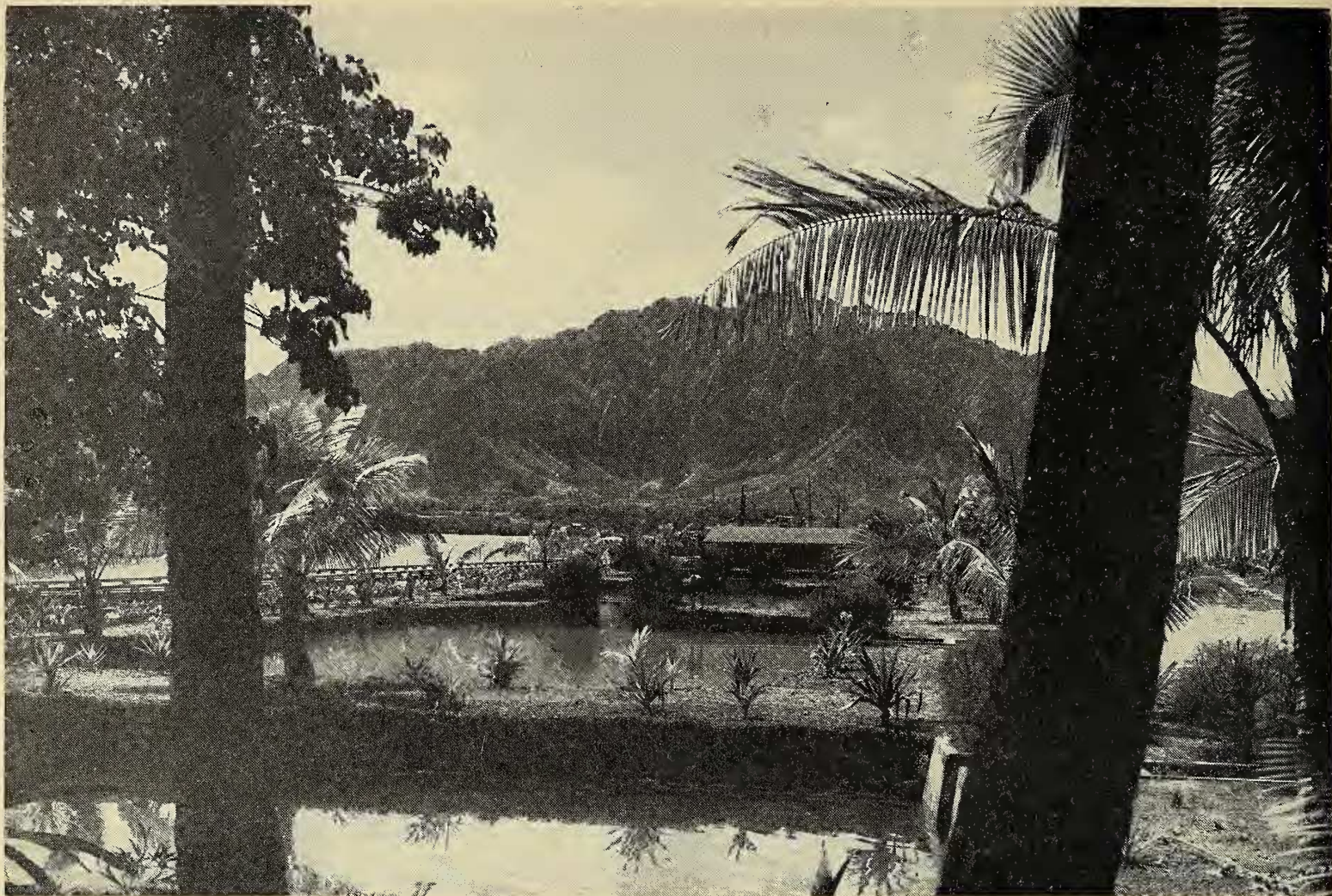
FIG. 2. View of some tidal ponds.

with an aggregate capacity of 20,000 gallons. The aquaria and tanks are provided with circulating sea water by a pumping plant separate from that which supplies the system in the laboratory building.